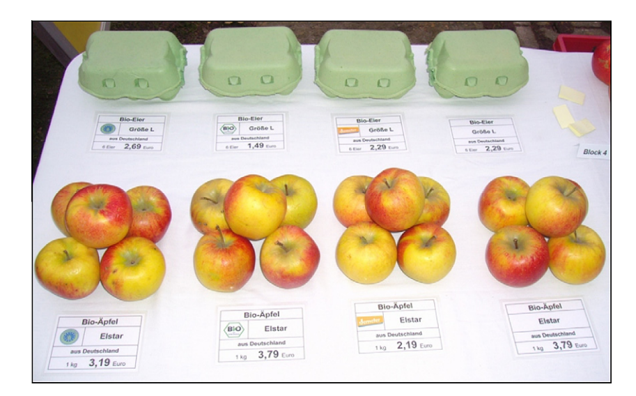
Fig. 1. Set-up of the choice experiments (Example from Germany).

approximately reflected the market share of that kind of shop in the respective country.<sup>3</sup> The participants were recruited on the spot based on quota sampling for age and gender using a structured screening questionnaire. The country-specific quotas for the two age groups ('18-44' and '45-75 years') reflected the shares of these groups in the total population. The quota for the share of the younger age group ranged from 43% in Italy to 60% in the Czech Republic. Regarding gender, the quotas reflected the buying behaviour of households in each country. The quota for the share of women ranged from 60% in the UK to 70% in Italy. To ensure that the results are relevant for the organic market, the target group were consumers who regularly buy the tested kinds of products (apples and eggs) in organic quality, which is why two screening questions were used: First, participants had to be responsible for the food purchase in their household; second, they had to buy organic apples and eggs at least once a month (based on self-assessment).